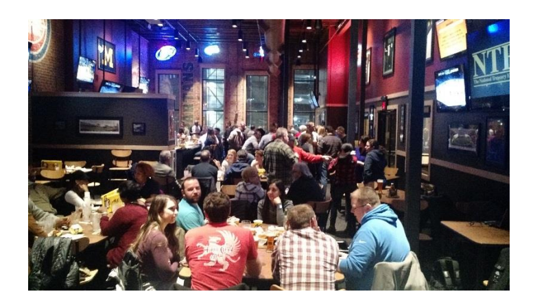
THE NTEU STRESS BUSTER RAFFLE!!!